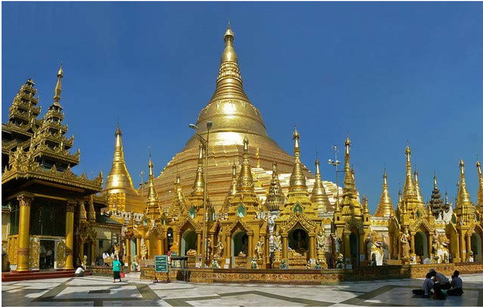
Shwedagon Pagoda, Yangon